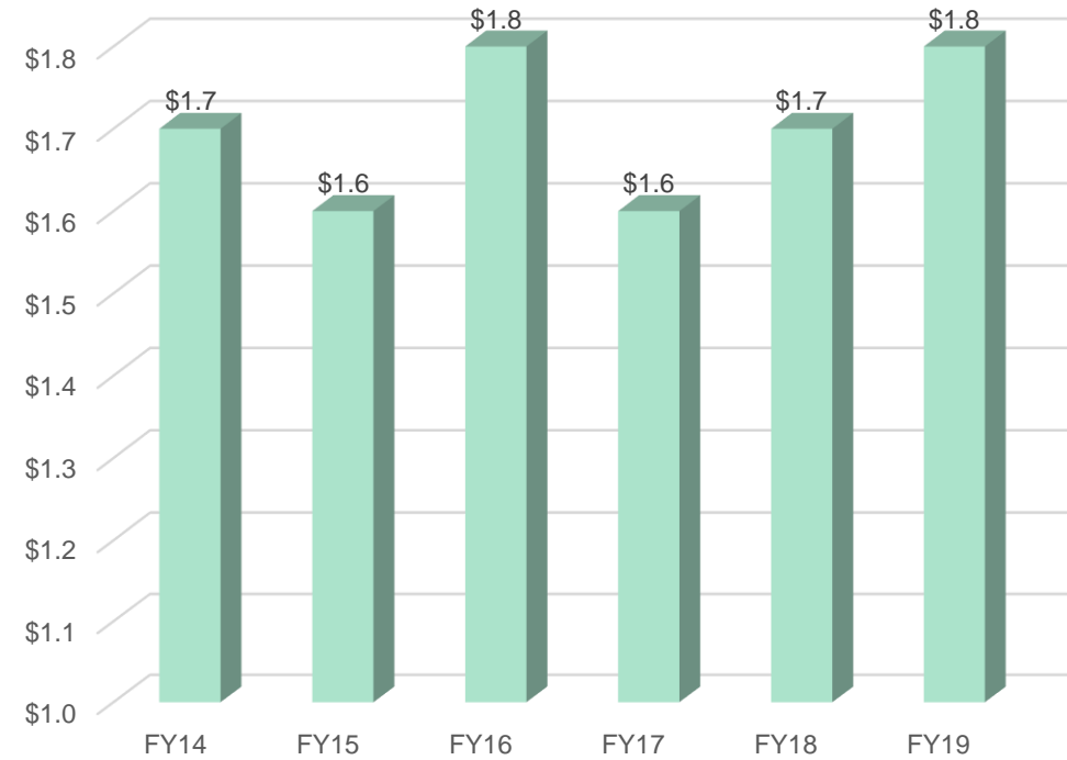
FEC Washington Volume of Business in Billions