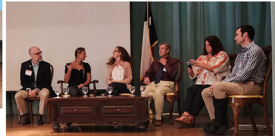
The panel discusses their viewpoint on a question from the audience