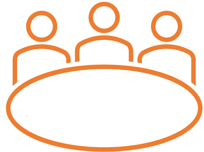
Discussion | Small group