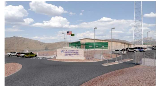
8a USACE A-E IDC for Horizontal Design