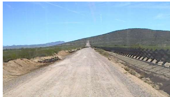
El Paso, Big Bend, Del Rio, Laredo, and RGV Sectors