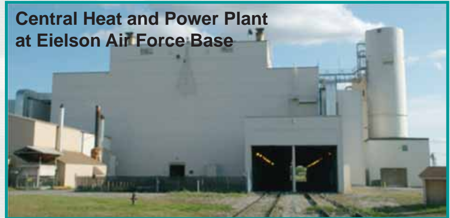
Central Heat and Power Plant at Eielson Air Force Base