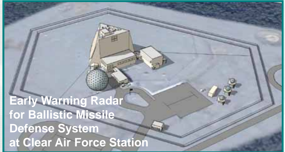
Early Warning Radar for Ballistic Missile Defense System at Clear Air Force Station