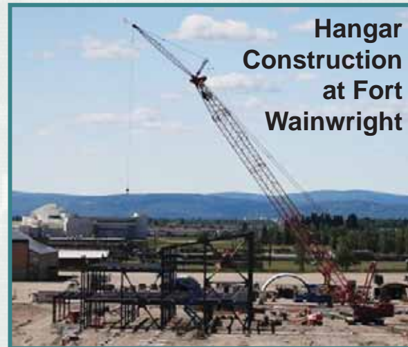
Hangar Construction at Fort Wainwright