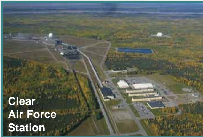
Clear Air Force Station