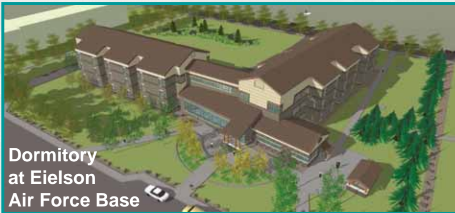
Dormitory at Eielson Air Force Base