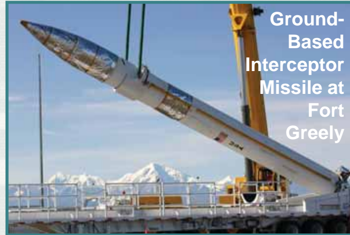
Ground- Based Interceptor Missile at Fort Greely