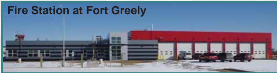
Fire Station at Fort Greely